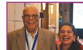
@ Abu Dhabi Diabetes Congress