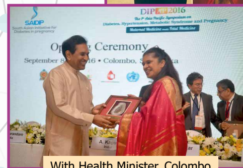
With Health Minister, Colombo