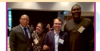
@ Quality Care Training Programme