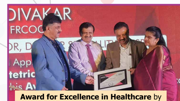
Award for Excellence in Healthcare by Medical Education Minister DK Shivkumar