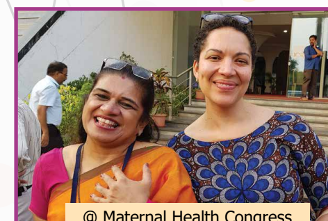
@ Maternal Health Congress