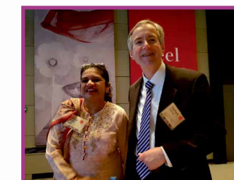
Meeting at Amsterdam