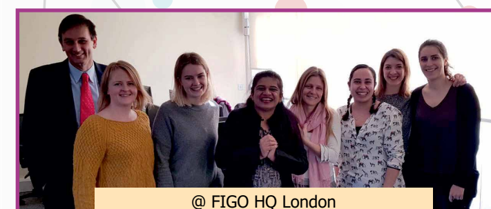
@ FIGO HQ London