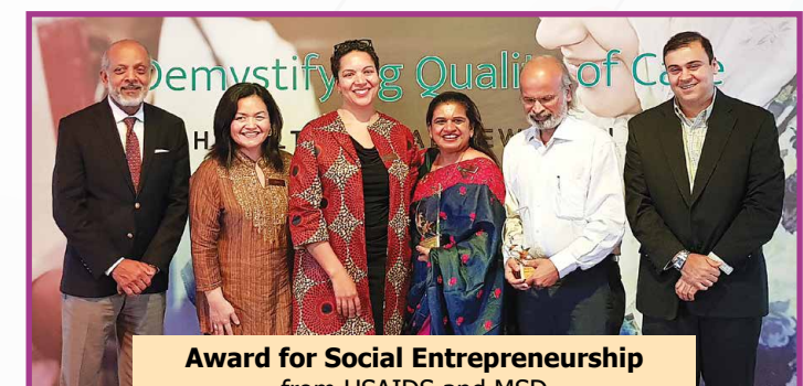
Award for Social Entrepreneurship from USAIDS and MSD