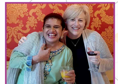
International meet on maternal immunisation