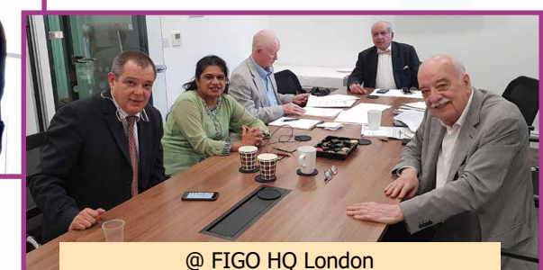
@ FIGO HQ London