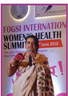
@ Women's Health Summit