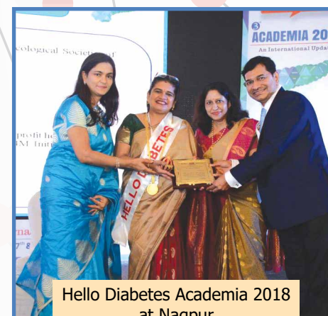
Hello Diabetes Academia 2018 at Nagpur