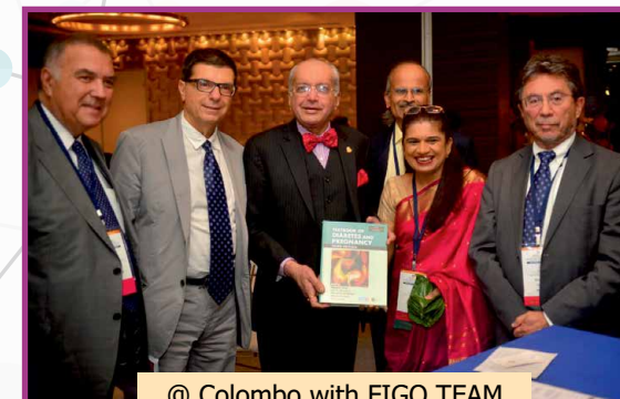
@ Colombo with FIGO TEAM